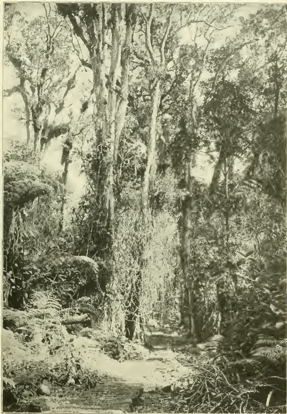
IN THE FORESTS OF PUNA (HENSHAW)